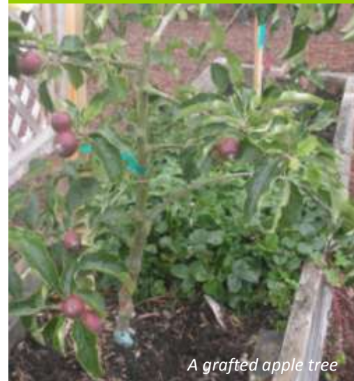
A grafted apple tree

Did you know that tree grafting was invented by the Chinese over 1000 years ago?