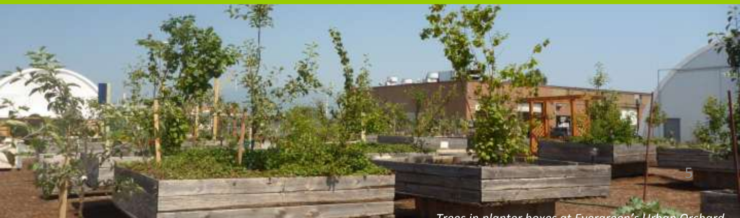
Trees in planter boxes at Evergreen's Urban Orchard

Here in the Pacific Northwest, our soils are generally more acidic than most plants and trees are adapted to, so we need to amend the soil with a yearly addition of lime. If you are unaware or doubtful of your soil conditions, it is possible to do your own testing to determine your soil's pH level. A home test kit can be bought at most garden supply centers.